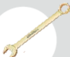
COMBINATION SPANNER 6mm to 50mm