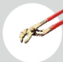
GROOVE JOINT PLIER 12"