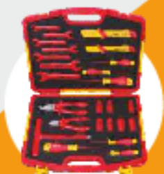
INSULATED TOOLKIT 25 PC SET