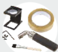
CROSS HATCH CUTTER