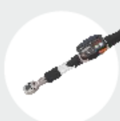
DIGIAL TORQUE WRENCH