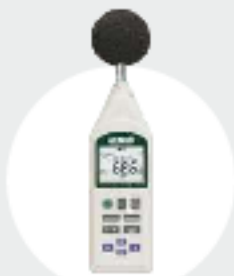
SOUND LEVEL METER