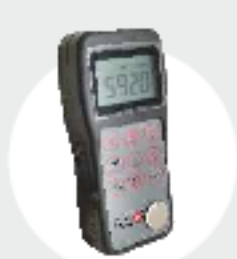
ULTRASONIC THICKNESS GAUGE