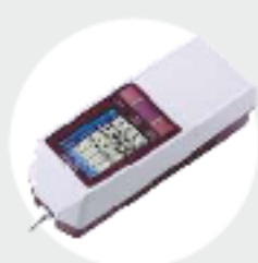
SURFACE ROUGHNESS TESTER