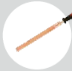
FILES 6", 8", 10", 12"