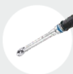
INDIAN TORQUE WRENCHES