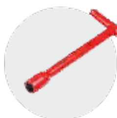
SOCKET WRENCH 8mm to 19mm