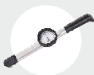
TOHNICHI JAPAN TORQUE WRENCHES