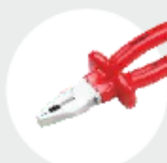
COMBINATION PLIER 160mm, 200mm