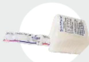
PRESS O FILM