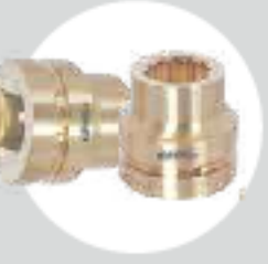
IMPACT SOCKET 6mm to 32mm