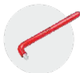
ALLEN KEY 3mm to 12mm