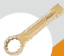
SLOGGING RING SPANNER 17mm to 150mm