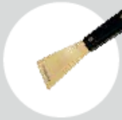
PUTTY KNIFE 75mm, 100mm, 150mm