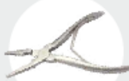
LONG NOSE PLIER