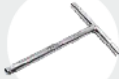
T-TYPE HEX KEY BALL END