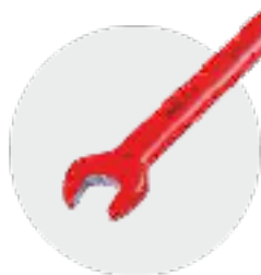
OPEN SPANNER 6mm to 32mm