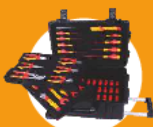
INSULATED TOOLKIT 52 PC SET