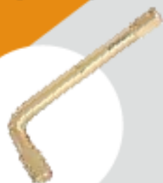
ALLEN KEY 1.5mm to 41mm 1/16" TO 1"