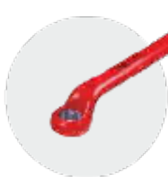
RING SPANNER 6mm to 32mm