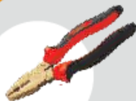
COMBINATION PLIER 6", 8"