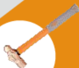
BALL PEIN HAMMER 230g, 340g, 450g, 910g