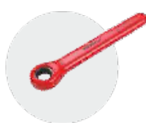
RING GEAR WRENCH 10mm to 19mm