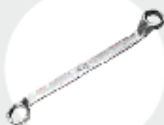
D/E RING WRENCH