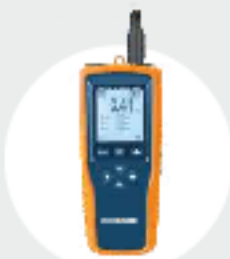
PRECIGAUGE COATING THICKNESS GAUGE