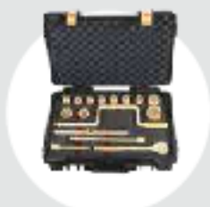
SOCKET SET 17 PCS