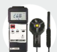
ANEMOMETER (WIND VELOCITY METER)

We offer solutions for measuring various environmental/atmospheric parameters such as temperature, sound, light, vibration, humidity & RPM. You may need the same for your compliance check or to monitor & maintain temperature & humidity in a lab environment. Those within the HVAC industry need these instruments for their installations. Monitor & optimize light levels, reduce the energy burden of buildings by significantly increasing the efficiency of the lighting system with a light meter. Or check the moisture content of building materials for water damage or harmful mould growth, using a moisture meter. Whatever the application we have a solution for you.