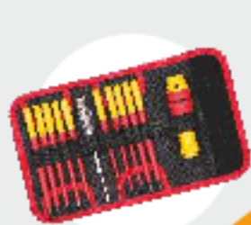
SCREW DRIVER SET 12PC