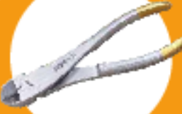
DIAGONAL CUTTING PLIER