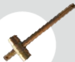
CYLINDER KEY 1.5mm to 12mm