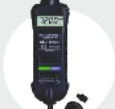
TACHOMETER (RPM METER)