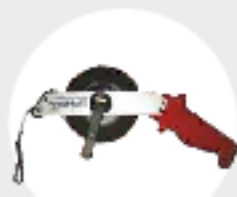
OIL DIP TAPE