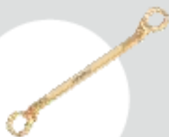
D/E RING SPANNER 6X7mm to 46X50mm