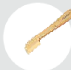
CARBIDE DRUM OPENER