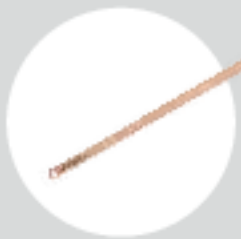
HACKSAW BLADE 300mm