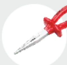
LONG NOSE PLIER 160mm, 180mm