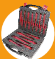
RING END SPANNER SET 20 PC SET