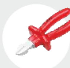
DIAGONAL CUTTING PLIER 160mm, 180mm