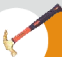
CLAW HAMMER 230g, 450g, 910g