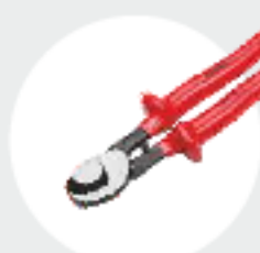
CABLE SHEAR 160mm, 180mm