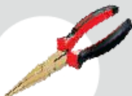
LONG NOSE PLIER 6", 8"