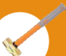
SLEDGE HAMMER 450g to 9900g