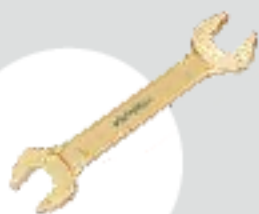
D/E OPEN SPANNER 6X7mm to 46X50mm