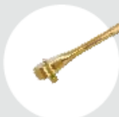
RATCHET WRENCH 1/2" to 3/4"