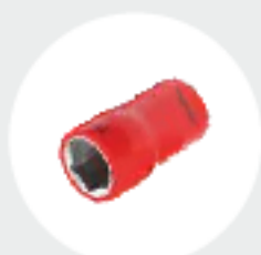
SOCKETS (1/2" SQ DR) 10mm to 32mm