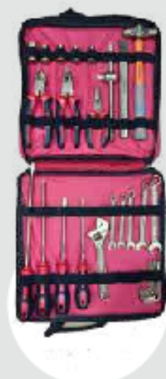
NON SPARKING TOOLKIT 26 PC SET