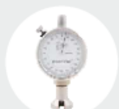
SURFACE PROFILE GAUGE