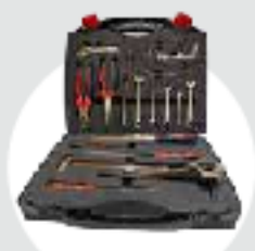
NON SPARKING TOOLKIT 21 PC SET