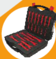
OPEN END SPANNER SET 20 PC SET