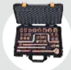
SOCKET SET 32 PCS