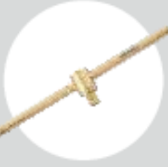
SLIDING T HANDLE