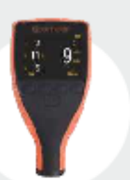
ELCOMETER UK COATING THICKNESS GAUGE

Non-destructive testing has seen huge innovations in the last 3 decades. Inspection equipment for coatings & metal industry now offers a plethora of solutions for inspections at various construction sites, industrial plants, labs as well as to coating service providers. Similarly in the metal & rubber industry a range of NDT equipment is available for measuring metal hardness, thickness, flaws, profiles, films, cracks, etc.