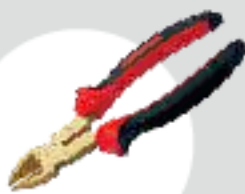
DIAGONAL CUTTING PLIER 6", 8"