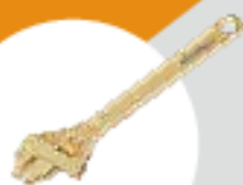
ADJUSTABLE WRENCH 6" TO 36"