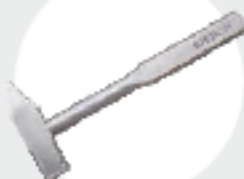
CROSS PEIN HAMMER