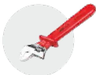
ADJUSTABLE WRENCH 200mm, 250mm, 300mm