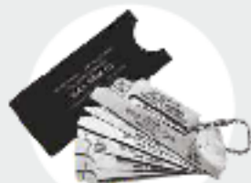
FILLET WELD GAUGE