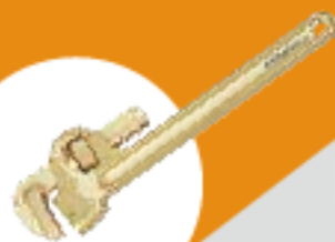
PIPE WRENCH 8" TO 36"