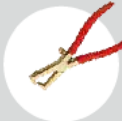
WIRE STRIPPING PLIER