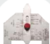
AWS WELD GAGE