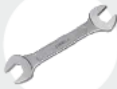
D/E OPEN WRENCH