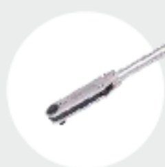
BRITool TORQUE WRENCHES