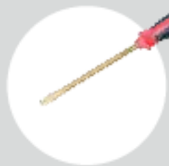
FLAT SCREWDRIVER 50mm to 350mm