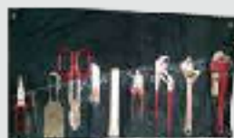
EMERGENCY TOOLKIT OISD 117