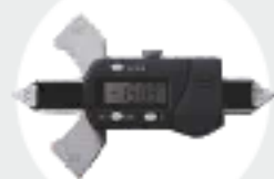
DIGITAL WELD GAUGE