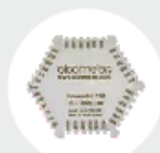
WET FILM THICKNESS (WFT) GAUGE