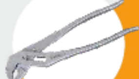
WATER PIMP PLIER