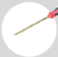
PHILLIPS SCREWDRIVER 50mm to 350mm