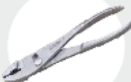
ADJ COMBINATION PLIER