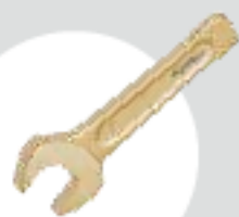
SLOGGING OPEN SPANNER 17mm to 150mm