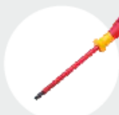
SLOTTED SCREWDRIVER 75mm to 150mm